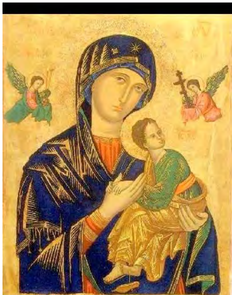
Our Lady of Perpetual Succour 27th June